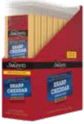
Sharp Cheddar Bar 18/1.5oz Inner Package