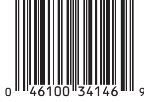
Pepper Jack Bar 18/1.5oz Inner Package